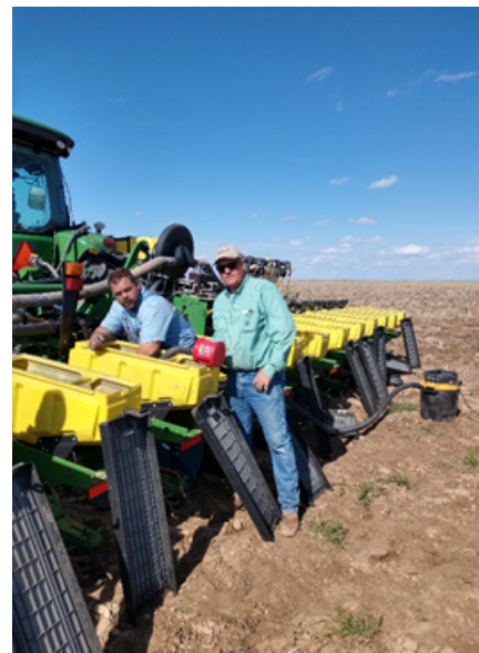
Cleaning and reloading planter units on May 24th, 2021 for a dryland, Replicated Agronomic Cotton Evaluation (RACE) trial in Moore county. Study site is in a strip till system and had good profile moisture at planting.